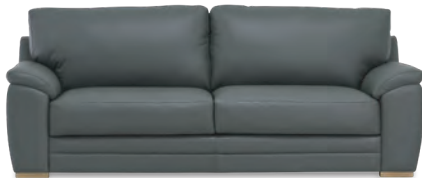
3 SEAT DUO