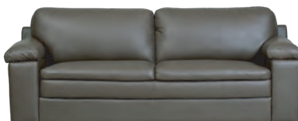
3 SEAT DUO